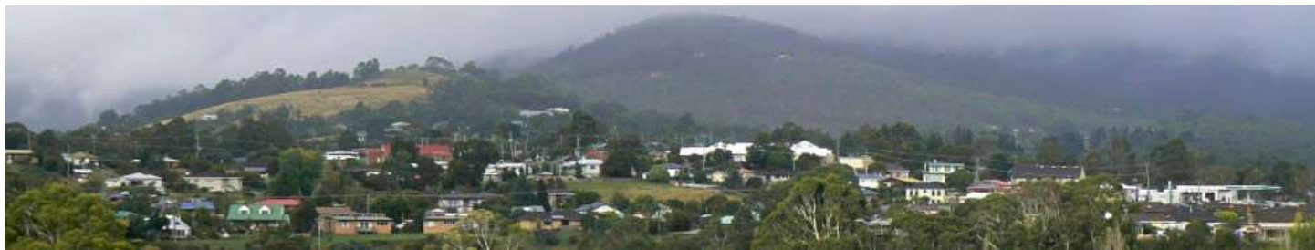
Panoramic view of Margate, Tasmania