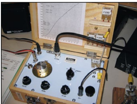
Bayou Jumper 40-Meter Transceiver Spy Radio Page 9