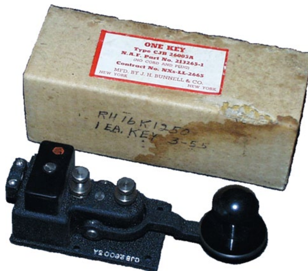
Navy Flame Proof Key Type CJG 26003A made by J. H. Bunnell & Co., March 1955 with the original box.