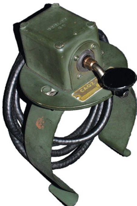
WWII Flameproof Leg Key CAQZ 26026 made by Brelco.