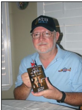
Americas Chapter Cumulatives Event Bug Key Winners! Page 8