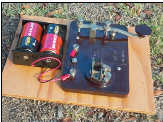
The Speed-X Model 450 Practice Oscillator.

After adjusting the buzzer's settings, I was able to make it sound a bit more pleasant to modern ears. The buzzer cover is missing and I haven't found a replacement. That cover might also reduce the volume and soften the tone.