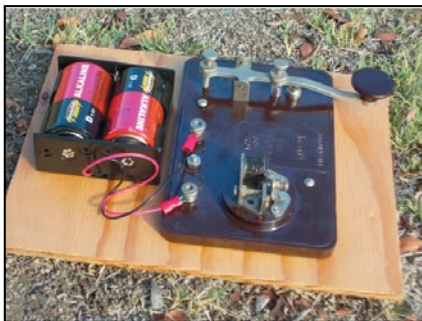
The Speed-X Model 45 Code Practice Oscillator, Page 8