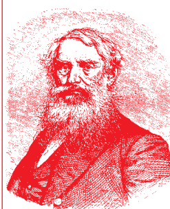
Samuel F.B. Morse 1791-1872