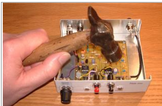
G3ZOD making final adjustments to the wayward Tixie!!

I've just "finished" building a Tixie QRP CW transceiver for 30m. This is a variation on the well-known minimalist Pixie transceiver that extends the design to include a keyer chip, side-tone and an automatic transmit offset. The transmitter works well into a dummy load, giving 1.5 watts output, but any attempt to connect a real antenna causes the PA/detector transistor to lock up after transmitting a few dots. I've not given up on it yet, but if all else fails I can always link the output of the keyer chip to the phone jack socket and use it as a keyer instead HI!