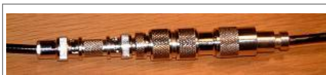
On looking at it later, it seemed rather complicated and no doubt very lossy. Nothing to do but take it apart for a closer inspection:

I needed to connect up a 2m antenna very quickly for a sked. It has a PL259 connector and the piece of coax I needed to use has a BNC plug on. (I'm trying to standardise on BNC now as screwing and unscrewing PL259s becomes very tedious when moving antennas between rigs. Also, long term it probably doesn't do the sockets any good either.) Anyway, I have a variety of adaptors and eventually conjured up a chain of them to link the antenna to the coax.