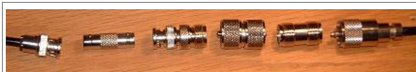
Oops! The two adaptors on the right aren't doing anything useful at all. This would have worked: